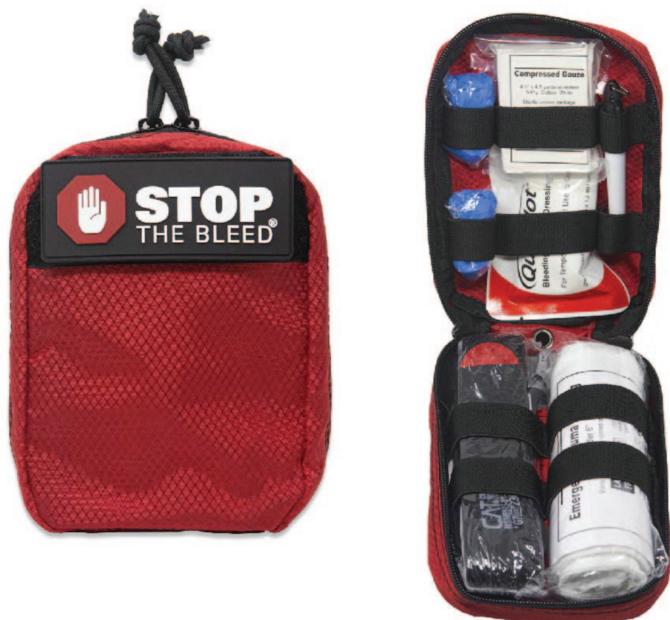
STOP THE BLEED® KIT- STB1-Pq-CAT