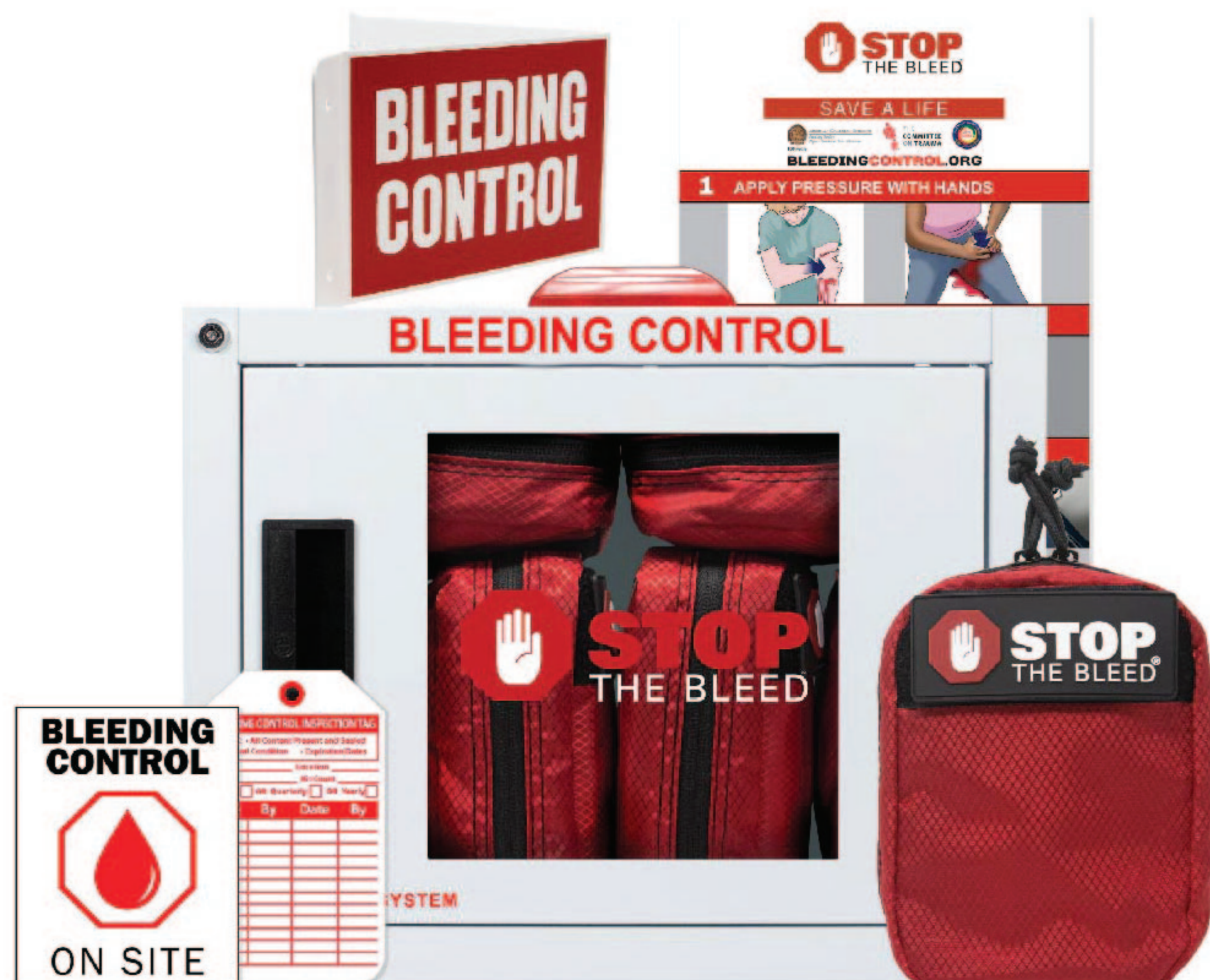
STOP THE BLEED® BUNDLE - STB1-QK6-CAT

FC Safety's new STOP THE BLEED® Bleeding Control Kits provide the lay responder with battlefield-tested tools to help control life-threatening traumatic blood loss. Our Department of Defense (DoD) licensed kits are expertly crafted, strictly following guidelines established by the American College of Surgeons.